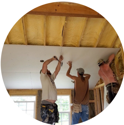
Vaulted Ceiling Drywall Install